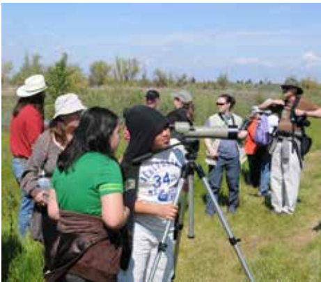
Activities during Creek Week include a "Birds & Bloom Tour" of the Bufferlands