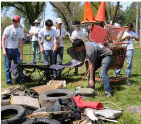
Volunteers gather at the celebration to create sculptures for the "Junk & Gunk Contest"